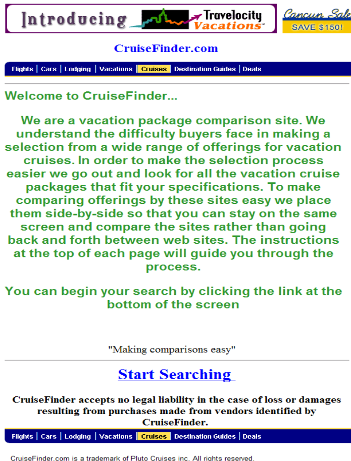
Figure 1: CruiseFinder.com

CruiseFinder was set-up to allow the participants to select alternative travel destinations on the first page of the web site, but all subsequent pages were set to the Panama Canal packages participants would evaluate and select. The two packages were set-up to model two different actual existing web sites to enhance realism, but each was carefully constructed to approximate a near indifferent state. In other words, the packages basically offered the same amenities, cruise stops, and cruise lengths at prices that differed only marginally. One cruise departed from Miami and terminated in San Diego, while the other cruise departed from San Diego and terminated in Miami. The two cruise options were always presented in the same order on the screen. The design factors of these two cruise packages therefore neutralized each other to help eliminate the possible confounds of these variables on the main endorsement effect (see Monroe, 1976).