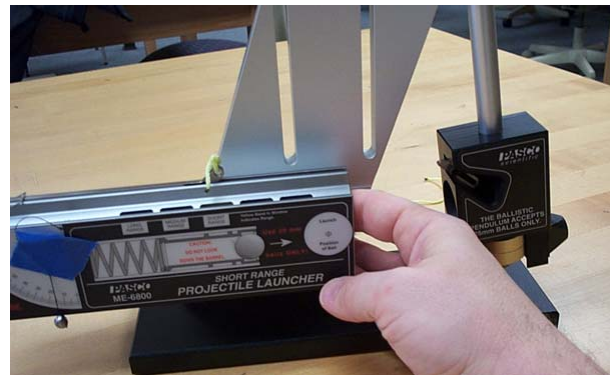
Fig. 2: Ballistic pendulum

In lab this week, we are going to look at a series of energy conversions to see how efficiency works. Figure 2 shows a picture of the ballistic pendulum that we will use in this activity. The device is quite simple to operate. Pushing back the spring-loaded piston on the projectile section stores potential energy that can be used to propel a ball. Once the ball has been propelled out of the launcher by pulling the trigger, it collides inelastically with the pendulum, thus transferring momentum to it. The pendulum then swings upward until all of its kinetic energy is converted to potential energy. The angle measuring system on the side of the device stops it at this height, allowing for measurements of the amount of potential energy stored. This potential energy can then be compared to the initial kinetic energy to see how efficient the energy is converted from one form to another.