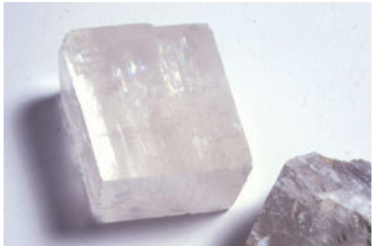
Fig. 1: Calcite crystal

The third and fourth criteria are less problematic. The fact that a mineral must have a crystalline structure eliminates all liquids. It also eliminates all glasses, as these are amorphous solids with no definite atomic arrangement. The chemical make-up does come with one caveat: some minerals are allowed to have substitutions of certain chemicals in their molecular structure. As an example, hornblende is a complex mixture of hydrous ferromagnesium silicate that can various proportions of calcium, aluminum, and sodium within it. These substitutions usually just change the color of the mineral and do not radically alter the other properties of the mineral.