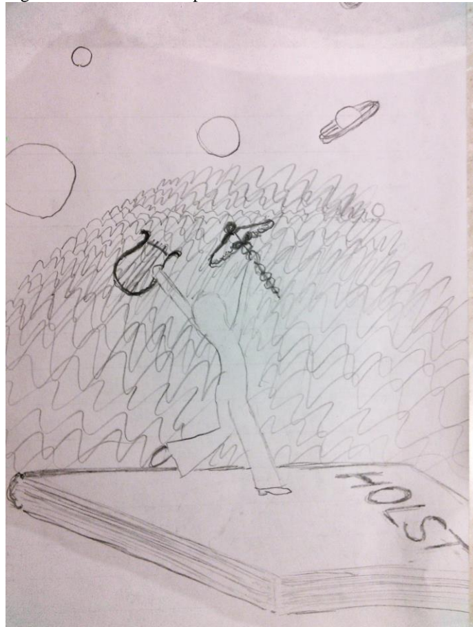
Figure 2 Teacher-as-Interpretive Artist

Teaching might very well be the oldest form of performance art...textbook and assorted readings serve as the score, and the goal is to convey the full emotional and intellectual weight of the content so that each audience member leaves changed” (Hughes)