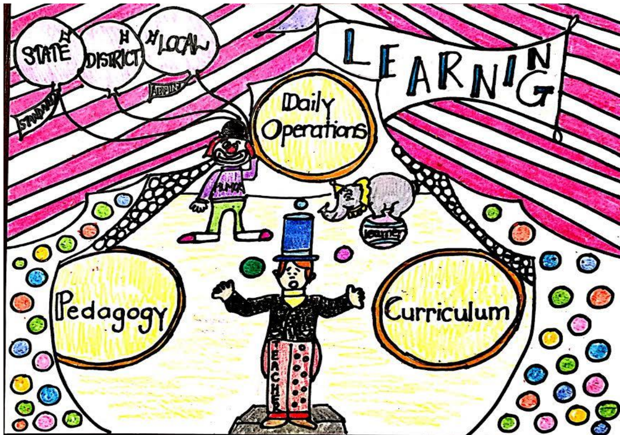
Figure 1. Pictorial metaphor example, Under the Big Top: Learning is a Circus.