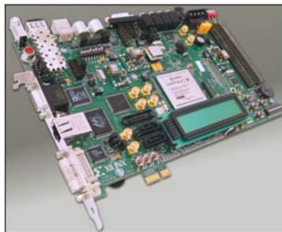
Figure 1. Xilinx FPGA Development Board (XUPV5-LX110T)

This project includes 4 parts: Binary adder, decoder, network traffic generation, and receiving network traffic as detailed in the following sections.