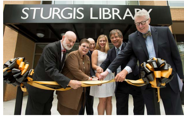
Sturgis Library ribbon cutting ceremony