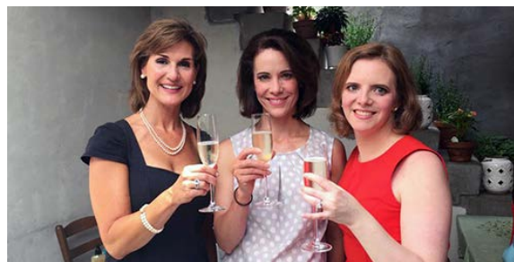
Friends of Gwinnett Library on January 27, 2016 at Garden Plaza of Lawrenceville at 12 p.m.