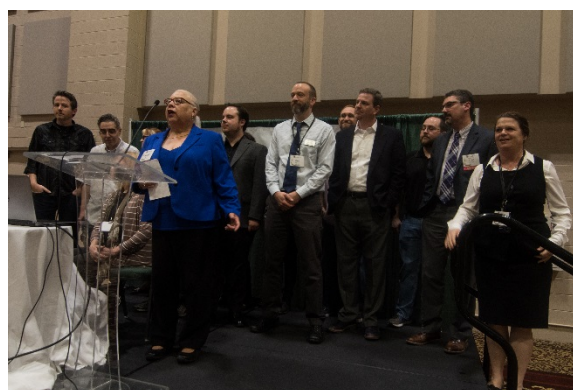
GALILEO staff sing "Happy Birthday" at COMO

A presentation on "GALILEO: Growing a Generation of Learners" was delivered at the September 15, 2015 University System of Georgia (USG) Board Meeting as a special acknowledgement of GALILEO's twentieth birthday.