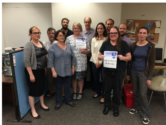
Digital Library of Georgia celebrates GALILEO's birthday

From a few databases and a simple interface to today's Discover search and other services, GALILEO has grown, evidenced by more than 1.7 billion user experiences. In honor of