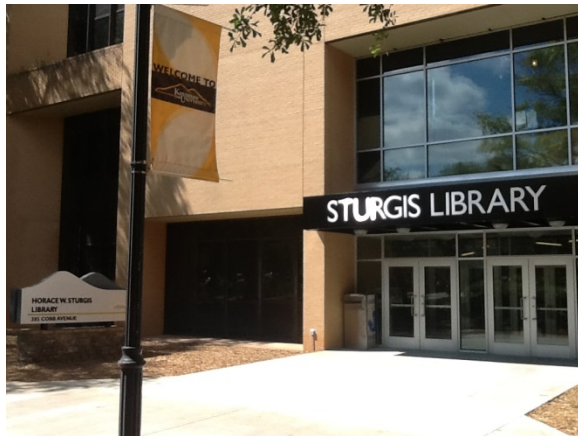
New ground floor entrance