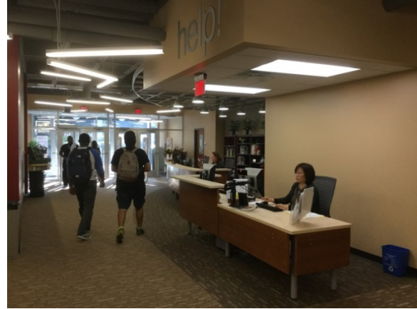
Help Desk and Check Out Desk

Part one of the Kennesaw State University (KSU) Sturgis Library renovation has been completed. The library has a new ground floor entrance. This new entry leads to the new check out and help desk. A learning commons and a large classroom are new additions. The Access Service Department relocated to this floor. Currently, the first floor is under renovation. Stay tuned for an update!