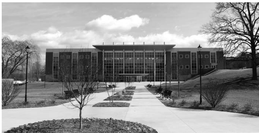
Winner: Best exterior photo of a library — Built in 2008, the Library Technology Center at North Georgia College & State University in Dahlonega, is now the centerpiece of the campus. The facility houses the school's writing center, IIT hub, study rooms and a café.