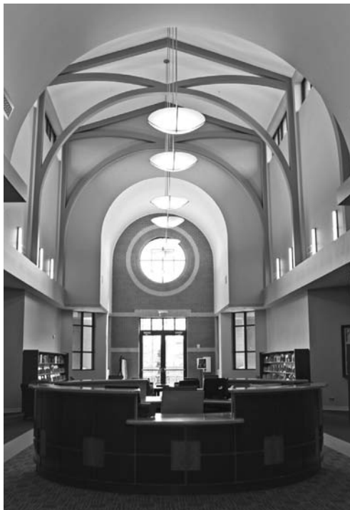
Winner (tie): Best interior photo of a library — The main area customers see upon entering the Coweta County Library, the Community Commons, was designed to be a welcoming space for patrons to browse for reading material.