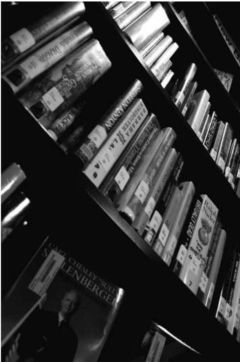
Winner (tie): Best interior photo of a library — The new book shelf at the Neva Lomason Memorial Library in Carrollton.