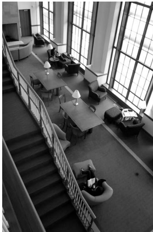
Winner (tie): Best interior photo of a library — McCain Library's Kate Durr Elmore Reading Room at Agnes Scott College.