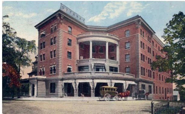
South Carolina Room postcard Ottaray Hotel