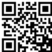
KSU School of Music Twitter