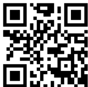
KSU School of Music