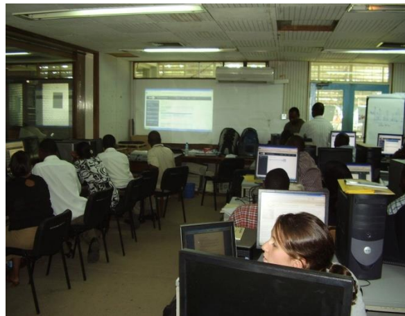
Figure 1: DHIS2 training

A situation analysis of the STI and VCT information management in Pwani region was conducted by the HISP team from 24th November to 12th December 2008. The situational analysis found among other things the need for new computers at both the district and regional level, and the need for the health facilities to be retrained on the paper-based tools. Following the requirements from the situational analysis, customization of DHIS2 was done where STI and the VCT paper-based tools were implemented in the database.