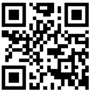
KSU School of Music