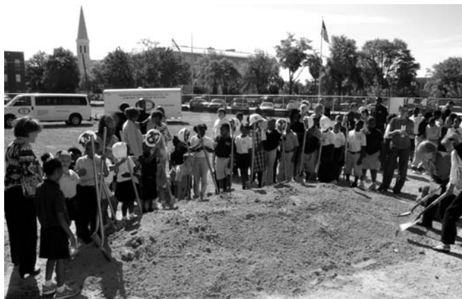
Shovels in hand, hundreds of people participated in the groundbreaking ceremony for the new Augusta library.

“The public library has a rich history in Augusta, but perhaps the most exciting news is that the public library will have an amazing future — as evidenced by the more than 300 people that were in attendance, with shovels in hand, ready to see the new library get underway!” said