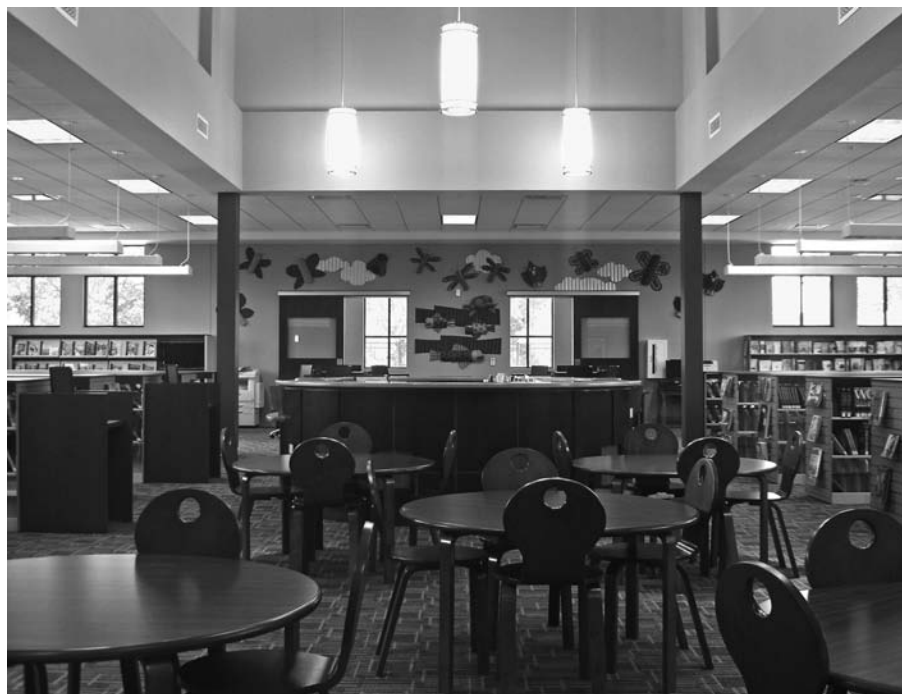
The children's area includes a variety of seating options.