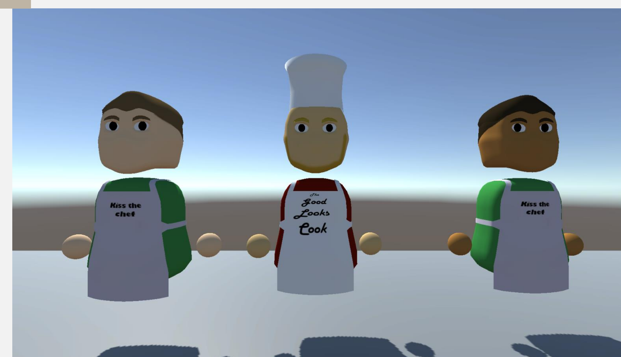
Character models made for Cosmic Cookoff