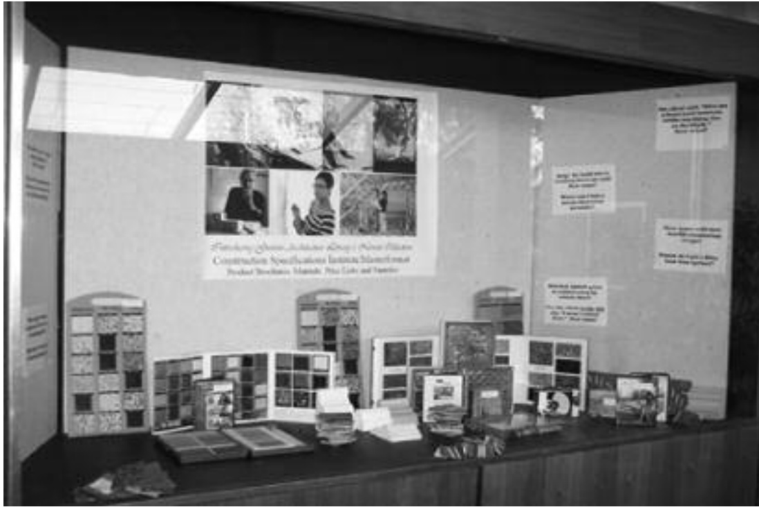
Window Display for the Unveiling of the Collection