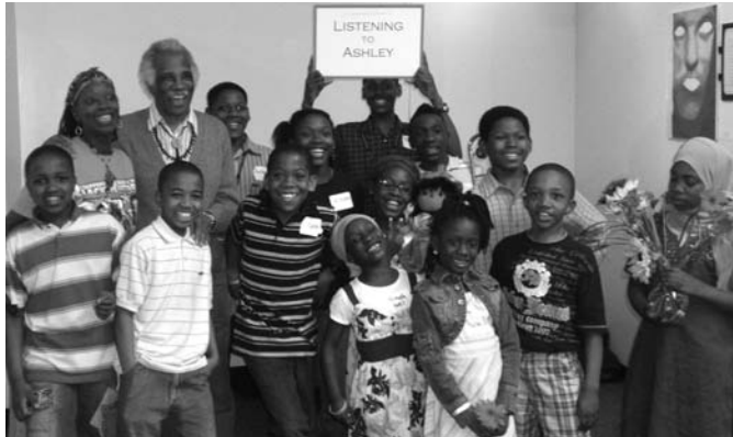
The Ashley Bryan Children's Literary Festival won many fans in Fulton County.

For more information, call the Fayette County Public Library at 770-461-8841. ►►