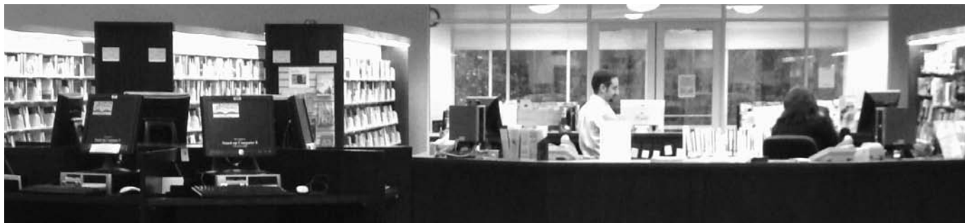
As part of its renovation, the Forsyth County Public Library's information desk was relocated to a central location that provides a welcoming view for patrons entering through the main doors.