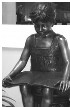
The Forsyth County Friends group helped purchase this bronze statue of a reading child.

Six more sit-down patron computers were added, with several additional stand-up terminals located near the stacks. Tables for laptop users to access power and data filled two walls. Shelving increased by 10 percent for expansion of the print and media collections.