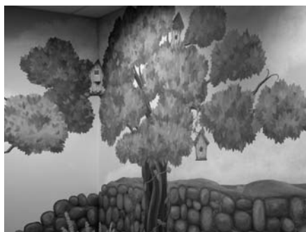
Large murals decorate two walls in the children's area of the library.

Administrative staff had been located in various offices, hallways and closets in the Cumming Library facility. They moved into the new headquarters building in January 2007. Once this was completed, a major renovation project was undertaken in the public area. About 3,500 square feet of space was reclaimed from former offices. A 1,000-square-foot reading room,