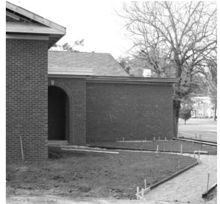
The most recent photo of the building project, taken November 19, features the new side entrance and future courtyard area.

"Recommended... for public and academic libraries." —Library Journal