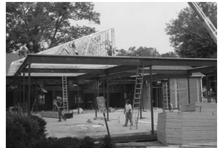
The steel frame construction begins.