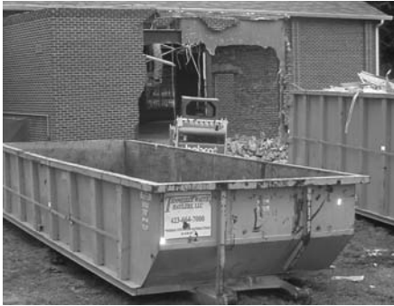
The demolition of the library begins with a small hole. The children attending storytime were allowed to watch the construction workers making the hole in the library building from a window in our temporary location, just next door in the Chickamauga Civic Center. One small boy said, "This is the best thing I have ever seen at the library!"

Chickamauga Public Library collection was re-housed in the Chickamauga Civic Center, located just behind our library building. Most of the collection was moved the first two weeks in June, and the library staff is most happy with the temporary location of the collection.