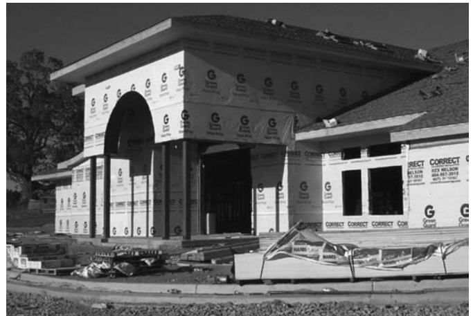
Above: In this November photo, workers have framed in the library's main entrance. Below: The Friends of the Library Coffeehouse and Cafe begins to take shape.

Another exciting development is that the landscaping irrigation for the project will be gray water provided from a nearby county treatment plant. ►►