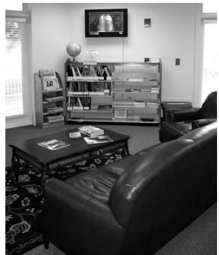
Comfortable seating and clean design elements make the reading room a focal point of the new St. Simons library.

The library is located in a high-visibility area at the northern end of Neptune Park. Sharing the building with the St. Simons Island Visitors Center, it sits in the shadow of the 104-foot St. Simons Island Lighthouse, one of the most recognizable landmarks on Georgia's coast. According to manager Maureen Hersey, the library currently has approximately 35,000 volumes. ►►