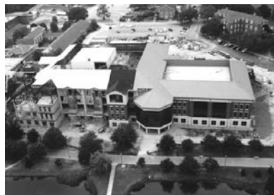
The aerial shot was taken in August 2007.

The project began in June 2004. A little more than two years later, the addition to the east side of the library was ready to serve students, faculty and staff. The entrance is highlighted by a striking three-story glass atrium and a virtual waterfall.