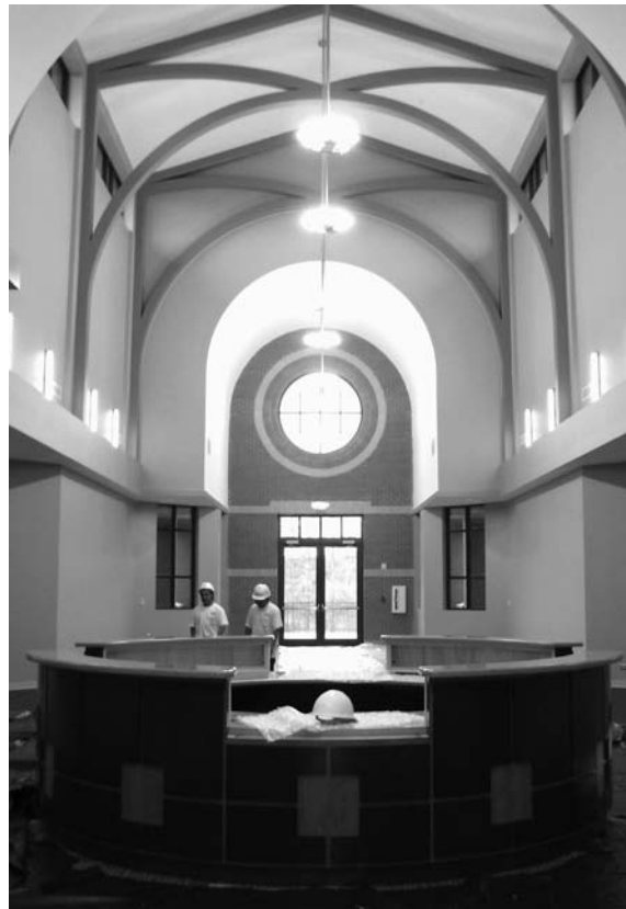
Patrons will be greeted by employees in a sun-filled atrium as they enter the new Coweta County Library.

The end result is a good balance for Coweta County — traditional meets contemporary. "We're excited," said Osborne-Harris. "We think something different is happening here." ▶▶