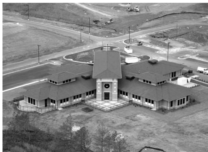
Aerial views show the front and back of the new Coweta County Library.