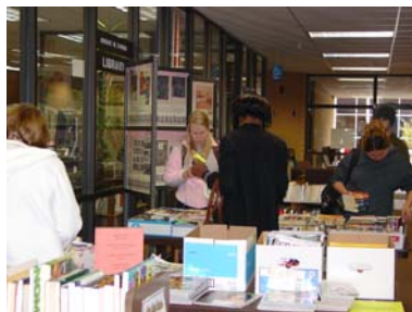
Library Book Sale in action

The Friends provided coffee, tea and hot chocolate for those "night owls" studying during finals week.