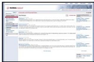
IHS Global Insight Screenshot

Please visit http://myinsight.globalinsight.com/servlet/cats?pageContent=home&imask=1 to begin using this program.