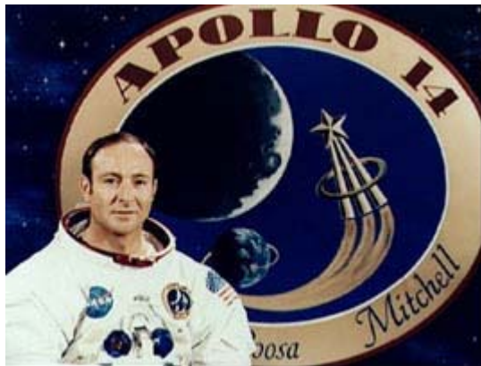
Dr. Edgar Mitchell, Apollo 14 Astronaut

Dr. Edgar Mitchell, Apollo 14 astronaut, made a donation of lunar artifacts to the Horace W. Sturgis Library on October 6th. Dr. Mitchell's donation, a collection of 250 Apollo 14 emblems and five small flags flown aboard Apollo 14, is the second collection of space memorabilia to be given to the library. Apollo 16 astronaut Charles Duke Jr. made a previous donation to the library in October 2007.