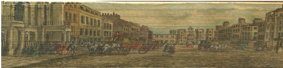
Fore-edge painting from The Memoirs of Count Grammont , Anthony Hamilton, 1811.