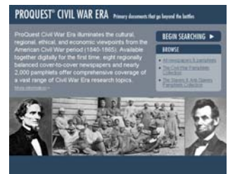
ProQuest Civil War Era, one of several new databases

The Sturgis Library has added a record number of new databases to its holdings. With the end of the budget year approaching, the library made a number of one-time purchases (rather than subscription based) of journal and e-book databases covering a wide range of subjects. While not all of these databases are currently available, they will all be in the near future through Galileo at http://www.galileo.usg.edu/ . To see databases as they are added, visit the library's New Databases page .