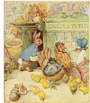
Illustration from Giger & Pickles , Beatrix Potter, 1909.

Exhibition Hours: ♦ Monday through Thursday: Noon - 6pm ♦ Saturday: 1pm - 4pm ♦ Closed: Friday & Sunday