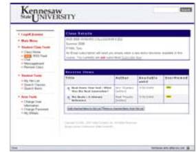
Screenshot of the Ares E-Reserve interface, from ATLAS-SYS.