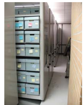
Part of the archives expansion.

To help accommodate this donation, the archives is completing an expansion that more than doubles their current size. The additional space, a large room previously used for storage on the second floor of the library, has been equipped with a set of compact shelving to maximize use. This freeing of space also allowed for a new research area with chairs and workspace to be installed. "Students working on projects barely had room to breathe," said Tamara Livingston, Archives Director. "We're thrilled." A ceremony is planned for February 21st at 2 PM, followed by tours of the new renovations and a reception. Guests are asked to make a reservation with Vera Gargano at 770-423-6289 or by sending email to vgargano@kennesaw.edu .