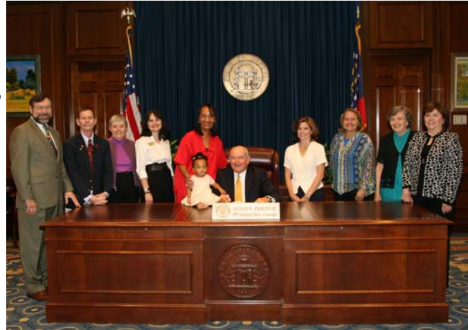
Presentation of commendation by Governor Sonny Perdue