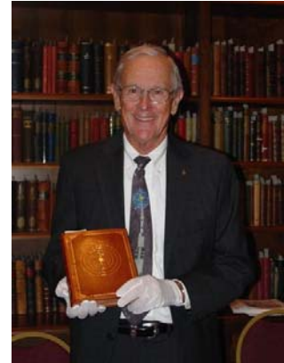
Charles Duke, Apollo 16 Astronaut, Visiting the Bentley Rare Book Room.

The Sturgis library received a singular gift on October 17th—artifacts carried and used by astronaut Charles Duke on his flight to the moon. Charles Duke was the lunar module pilot for Apollo 16 in 1972, and is the tenth man to have walked on the moon. The items donated included the Apollo 16 lunar rover map, the lunar module contingency checklist, and twenty miniature Georgia state flags flown aboard Apollo 16. At the presentation of his gift, he gave a talk about his experiences to a crowded presentation hall and answered questions from the audience. Afterwards he visited the Bentley Rare Book room, where his donation will be housed.